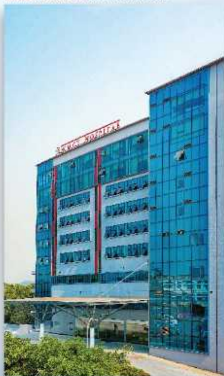
KMCT MEDICAL COLLEGE HOSPITAL